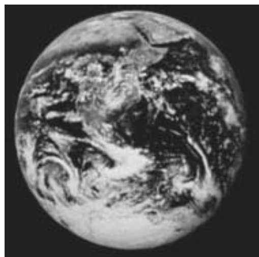
● Planet Earth - We must start to clear up our own mess

Liberal Democrats have insisted on full public scrutiny of any formal proposal for a new Waste Plant.